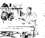
Illustration of a factory or industrial building.

There are many useful by-products that can be derived from various sources. These products are of great value and can be used in many different ways.