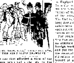
Illustration of a group of people.

The population of France has been increasing steadily over the years. This is due to various factors, including improved healthcare and living conditions.